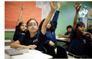
5 th graders eager to share their knowledge during math class.

To learn more about KIPP Austin, or to schedule a visit and see our amazing students and teachers in action, contact Tess Williford in the Development Department at (512) 501-3643 x204.