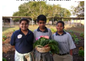
Food & Garden Club students show off their harvest from KIPP's organic garden.