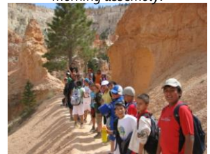
Students learn about climbing the mountain to college in Utah's national parks.